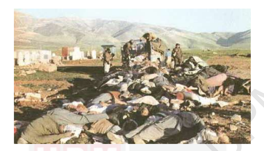
Figure 1.1 Dead Bodies of Halabja Residents Unloaded for Mass Burial (Source: Black, 1993).

The armed conflicts in Iraq were indirectly responsible for the destruction and degradation of the environment and it contributed in turn to further conflict (UNEP, 2003a; Barnaby, 1991). Generally, the environmental impacts of war can be understood by examining the magnitude and duration of effects, involved ecosystems in specified geographic locations, the use of individual weapons systems, the results of particular production processes and the cumulative combined effects of specified military campaigns. From this perspective, four activities can be seen as having prolonged and pervasive environmental impact with significant consequences for human populations, production and testing of nuclear weapons, aerial and naval bombardment of terrain, dispersal and persistence of land mines and buried ordnance, and use or storage of military despoliants toxins and waste (Leaning, 2000 ; Abuelgasim & Woodcock, 1999; Bagour, 2006;. Barnaby, 1991; El-Baz, 1994; Stephens, & Matson, 1993)