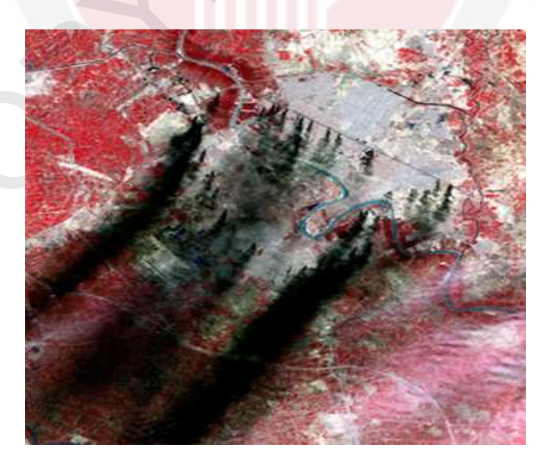
Figure 1.2 Oil Field Fire during the Gulf War

There was a great damage to an estimated 4,000 cities, villages and towns and their surrounding environments and economic losses in financial terms have been estimated to be billions of dollars (Baker, 2007). The sequence of aerial bombardment, destruction of homes and urban and rural infrastructure, forests, farms, transport systems and irrigation networks and progressive waves of dislocated or homeless people, can be seen in all parts of Iraq. For example, in the 30 years of the war in Iraq, an era marked by sieges of cities, attacks on safe havens and the pulverization of towns to effect ethnic cleansing, millions of people have been forced to flee within or across national borders. These wars crippled the urban support systems of major cities and led to water pollution, decline of safe drinking water and the significant spread disease, especially bacterial disease such as typhoid fever that have increased tenfold since 1991. Additionally, the bombardment of sulfur plants and oil fields that burned for a whole month in July 1991 were a vivid image of a major part of the environmental damage caused by the war that has been contributing to air pollution (see figure 1.2).