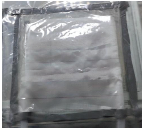
Fig. 1. Prepared vacuum infusion system

After the preparation of the vacuum infusion was completed, the dispersed silica nanoparticles/epoxy solution was extracted from the vacuum oven and the hardener was mixed. The mixed resin was then infused into the system prepared until the whole kenaf mat was wet. Next, the inlet and outlet was sealed and the whole system was left for 24 hours before being removed. The post curing of the plate was done next under the temperature of 80 °C for 2 hours.