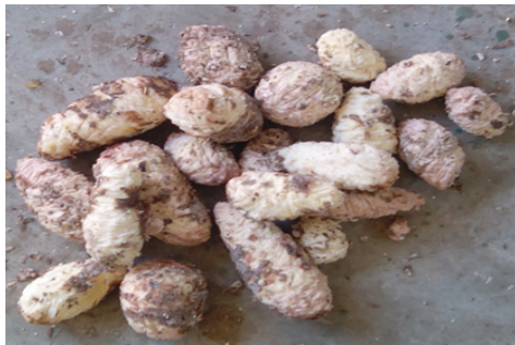
Figure 3. Cocoyam tuber peeled by the machine

Figure 3 shows the picture cocoyam after peeling with the machine. At 400 rpm, 700 rpm and 933 rpm peeling drum speed, the average throughput capacities were calculated to be 63.20 kg/hr, 84.90 kg/hr and 112.92 kg/hr respectively, average percentage peeling weight proportion were recorded to be 99.80%, 99.70%, and 98.50% respectively while average percentage peeling efficiency of 50.00%, 64.00% and 68.00% respectively were also achieved.