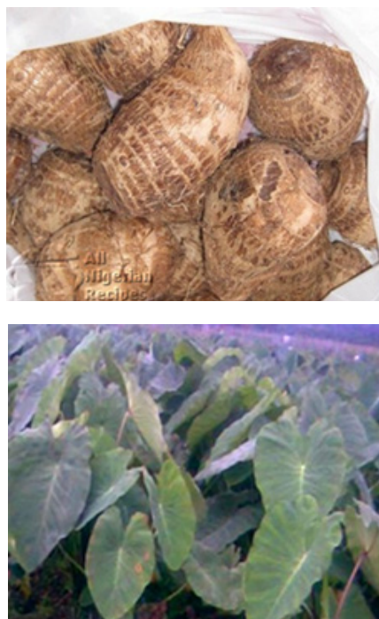
Figure 1. Cocoyam tubers and plants

4.0 mm respectively. The minimum values were calculated to be 56.0 mm, 29.0 mm and 8.77 mm respectively. Also the hardness of the cocoyam was measured so as to know the required force for peeling the periderm of the cocoyam. The highest value of compressive strength for cocoyam when placed horizontally and vertically is 1.84 kN and 1.40 kN respectively (Balami et al. , 2012).