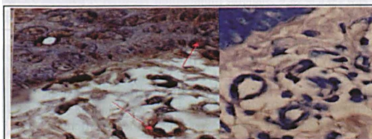
Light photomicroscopy showing an intense immunoperoxidase reaction in the skin