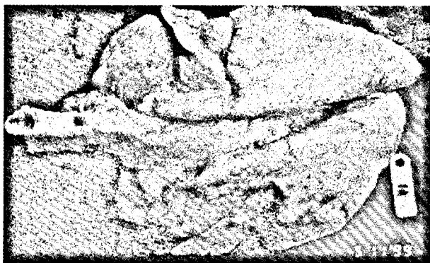
Plate 1: The lung of a vaccinated goat challenged with Mannhaemia haemolytica A2 following dexamethasone treatment showing extensive areas of pneumonia.