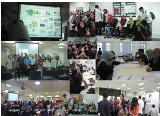
Figure 3: Joint Presentation and Exhibition

At the end of the studio exercise, there was a joint-presentation and exhibition in front of the panels (consisted of both UPM and UIN lecturers) in Indonesia and Malaysia in the middle and end of the semester.