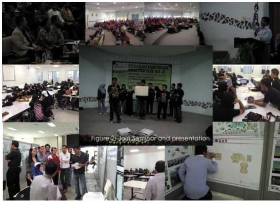
Figure 2: Joint seminar as a medium for additional input lecture and discussion for both university

At the end of the studio exercise, there was a joint-presentation and exhibition in front of the panels (consisted of both UPM and UIN lecturers) in Indonesia and Malaysia in the middle and end of the semester.