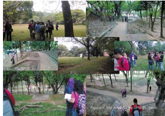
Figure 1: Site visit by students from both universities.

For students, that are not in the same country as the site is, they have to depend on the information given by the local students site analysis report. They have to accept the challenge of understanding the site from distance and do their best to comprehend the local architectural principles, cultural behaviors and etc. Based on the given information, both studios are given a chance to apply their design approaches and produce designs based on the existing information.