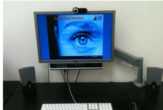
Figure 1: Desktop based eye-tracking equipment where Shuttle-1 was used by researchers to monitor eye-tracking experiment and Shuttle 2 was equipped with an eye-tracking infrared sensor to track the participants eye movements.

Generally, research in eye-tracking focuses on several types of gaze data, including saccades, fixations, dwelling time, and scanpath (Figure 2). Eye movements (gaze) are not a continuous process when viewing pictures or a static scene (Pomplun, 1998). Eye movements that tend to leap from one inspected location to another are identified as saccades, and the motionless positions between those leaps are fixations (ibid). Dwelling time is defined as time durations for individual fixations, while scanpath refers to eye movement patterns that emerge from a sequence of fixations (Jacob & Karn, 2003). Results from other experiments have suggested that the gist of a scene can be comprehended by a viewer with the first few fixations (Duchowski, 2007).