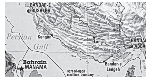
Figure 2: Location of Kish in the region, (source: www.worldatlas.com )