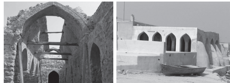
Figure 4: a house in Harireh city and Jameh Mosque are some samples of historical parts of Kish

Based on the evidence, the historical background of Kish is illustrated through three main eras, namely, before modernization, modernization-before the Islamic Revolution and modernization-after the Islamic revolution (Baum & O’Gorman, 2010). The term tourism undertakes a main role in all the eras and has always been influenced by the political, social and economic features of the island. Kish Island, which is located between the Persian Islands in the region, has the longest history of tourism, with more than 1300 years (Nasr, Mostoufi & Zaryab, 1971) (Figure 4). The modernization of Kish was established in 1968 when Kish Island was selected as a tourism free zone by American experts due to its natural geographical features (Zalzadeh, 1997). At that time, huge changes were made to the island, and these emphasized on the development of international tourism (Zalzadeh, 1997).