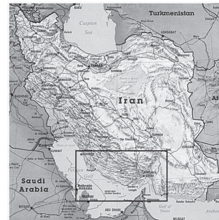
Figure 1: Location of Kish in Iran

A review of the literature has shown that although small islands have long been aware of their intrinsic limitations for tourism development, none has seriously made any accommodation with sustainable tourism. On this matter, small islands are assumed to have balanced their social, economical and environmental aspects toward sustainable tourism development. In order to achieve this objective, they should identify their own tourists’ needs both in the short- and long-term, as well as the concerned individual characteristics like small size, the fragility of the ecosystem and finite resources. This paper utilizes these characteristics for investigating sustainable tourism in a small island, namely, Kish in the south of Iran (Figure 1, 2).