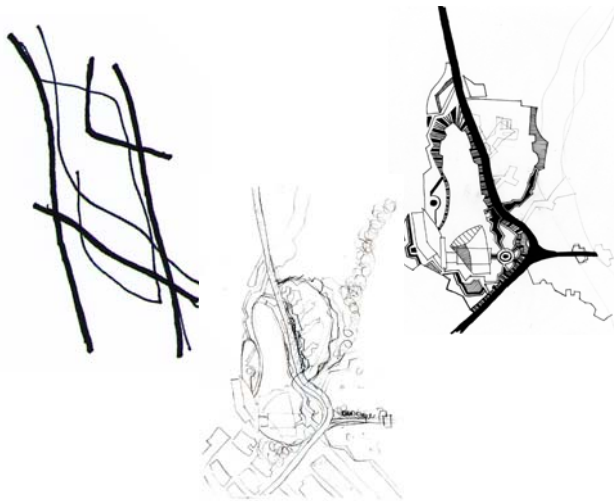
Figure 2: The conceptual endeavour.

The project, entitled Transcendence, a preservation of Tengku Kudin resident at Kubang Pasu, Kedah is an intriguing adventure of design narrative embedded with nostalgic and retrospective value. In this project, the designer seeks to redefine traditional cultural heritage and historical value by providing varies experiences for the visitor through art, architecture and environmental preservation. In this endeavour, he tries to capture the moment of history by narrating it through the space organisation, spatial intergration, spatial articulation, architecture and landscape connectivity and integration. In doing so, the designer tries to raise the historical value not by mimicking the existing landscape but by further enriching and creating new and dynamic vocabularies. An important aspect of landscape design is to make people understands the importance and significance of its spatial integration and organisation (Figure 2).