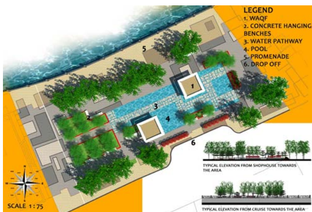
Figure 5: The master plan