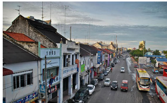
Figure 3: The historic Muar town

The second project, the Geometric Intervention is looking into the complexity of the existing urban fabric which is embedded with rich historical narrative. Designed by Mohammad Saifuddin Mazlan, the waterfront development echos the historical ripples of sungai Muar (Figure 3). Here, the spaces is fragmented into compositional phrases which clearly defined the spaces and its activities. Space articulation and hierarchical order is the protagonist of the composition. He creatively introduced different proportion and hiearchy of squares and rectangle to create a spatial quality with the intervention of hardscape and softscape. Geometric form handsomely intervened the spatial composition creating a dynamic and intriguing expression. Though the intervention of the fragmented phrases seem to create paradox to the existing fabric, the logic of aesthetic combines with functional strategy revealed an unprecedented sympathy to the site. The squares and rectangular form of the existing fabric (the buildings) is subtly transformed into a three dimensional functional spaces (Figure 4-6).