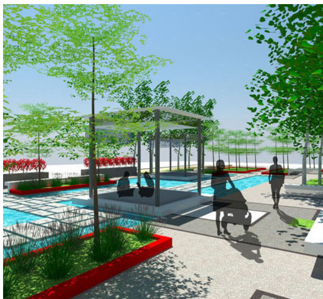
Figure 6: The space intervention