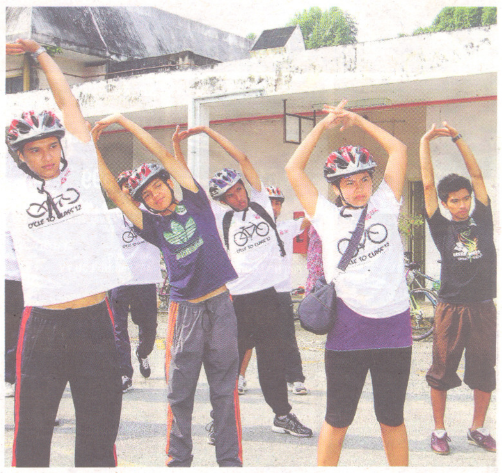
Easy does it: The students warming up before getting on their bikes.