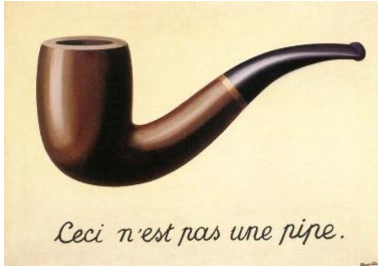
Fig. 1. Magritte, René. The Treachery of Images . 1928-29. Oil on canvas. Los Angeles County Museum of Art, Los Angeles.

This is not a pipe—it is a painting of a pipe. Surrealist artist René Magritte's 1928 painting, The Treachery of Images , (see fig. 1) introduces the issue at the heart of representation: that which is represented is not real. In a world increasingly infatuated with and dependent on representations, whether a photograph, a painting, a Facebook profile, or a description of any other sort, the issue of how one presents, represents, and re-presents oneself is a central issue when considering the truth of one's identity—and the truth of the identity of others.