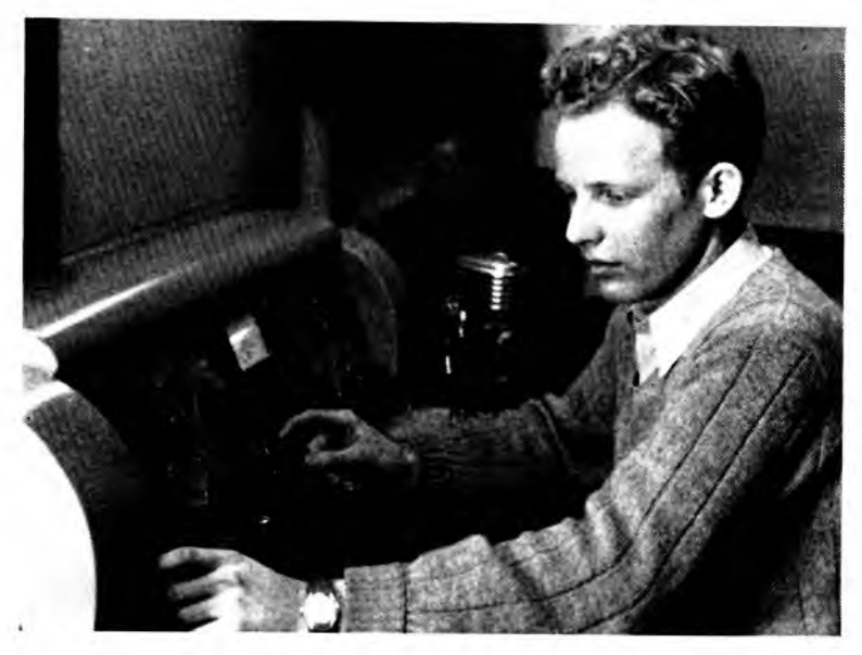
IN THE RADIO CONTROL ROOM