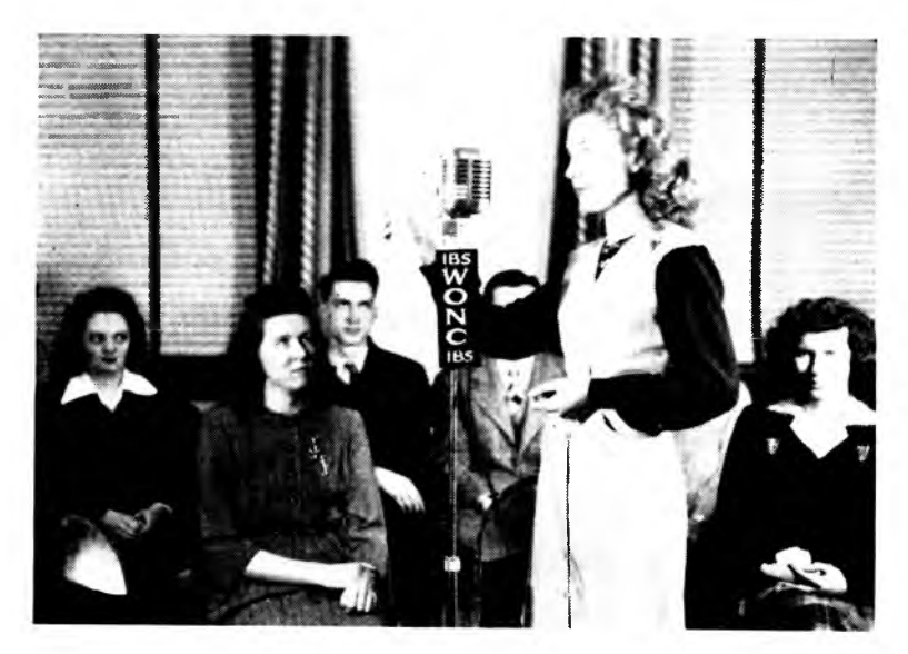
OLIVET ON THE AIR