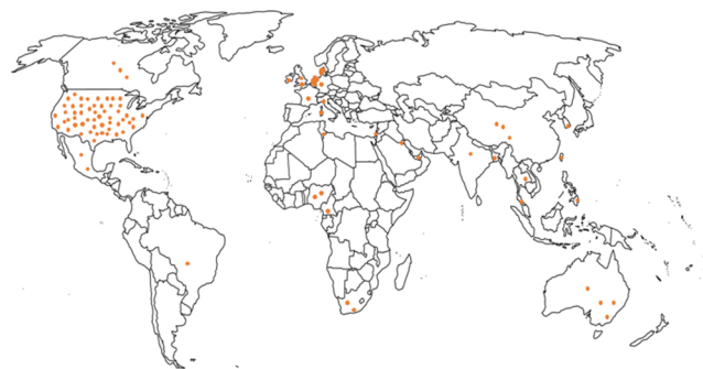
Fig 3. Geographical distribution of included studies.

Among the 56 studies assessed as observational study designs, 19 were cross-sectional, of which seven had high risk of bias [52–58], four had a moderate risk of bias [59–62] and eight had low risk of bias [63–70]. 15 were cohort studies; one study had a high risk of bias [71], five had a medium risk of bias [72–77], and eight had low risk of bias [78–85]. One study used a case-control study design and had a moderate risk of bias [86]. 14 were pre-post studies; one had a high risk of bias [87], 11 had medium risk of bias [88–98], and two had low risk of bias