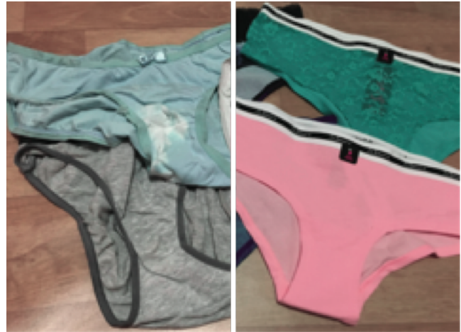
Figure 4. Underwear before (left) and after (right) becoming a member of LiftBlr. This image appeared in a post entitled “the benefits of lifting” where the author claimed that shoplifting improved her self confidence by allowing her to wear new underwear.

There are also memes, poems and references to the mysterious and instinctive nature of shoplifting; the following poem was intended to be sung to the tune of Jingle Bells: