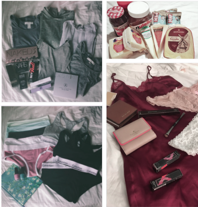
Figure 3. Image of a "haul" of stolen items.

caught or celebrate why it is worth being a LiftBlr. The following is an account that described the pictures in Figure 4 in a post entitled “benefits of lifting”: