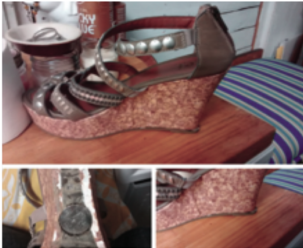
Figure 2. Shoe with hidden magnet for removing security tags.

of the data through designing according to three very different understandings of design research in HCI.