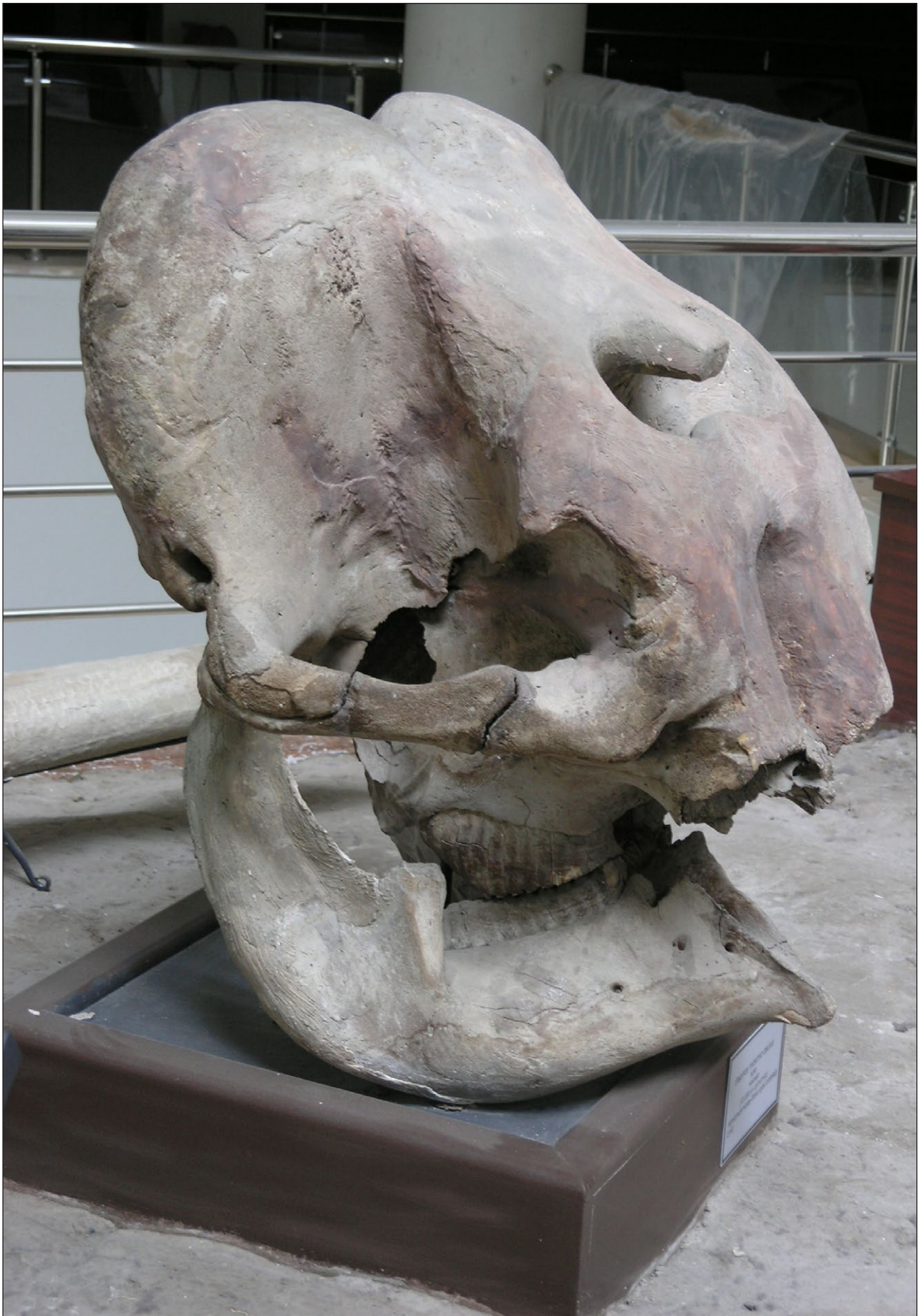
Figure 2: A partially reconstructed skull of Elephas maximus from Gavur Lake Swamp (MTA Natural History Museum, Ankara).