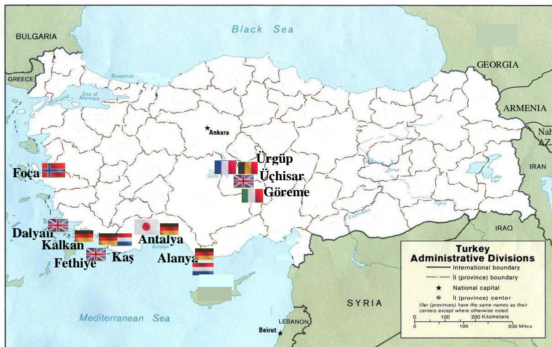
Figure 3: Regions Preferred by Foreigners in Turkey

In Turkey, touristic and historical places are dense particularly in the regions of Aegean and Mediterranean. Indeed, areas in which foreigners acquire real property are also mostly located in these regions. Investors have consisted of retired people over the middle age. The average price of houses acquired is 70000 US$. These people have preferred identical region to live together. Besides, they have preferred to purchase villa or to build dwelling by buying estate. The location of preference regions in which citizens of selected some countries acquire real property in Turkey is given in Figure 3 (Kas, 2003).