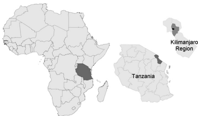
Figure 1. Africa, Tanzania and Kilimanjaro Region. Moshi Rural District shown in dark grey and Moshi Urban District in black in the Kilimanjaro Region inset. Modified from Biggs HM, Hertz JT, Munishi OM, et al. Estimating leptospirosis incidence using hospital-based surveillance and a population-based health care utilization survey in Tanzania. PLoS Negl Trop Dis. 2013;7(12):e2589.

Fever surveillance was conducted at two referral hospitals in Moshi. Moshi is situated in the Kilimanjaro Region of Tanzania at an elevation of approximately 890 m (Figure 1). The climate in Moshi is tropical, with rainy seasons from October through December and March through May. Aside from urban Moshi, the region is rural. The Kilimanjaro Christian Medical Centre (KCMC) is a 450-bed hospital and the zonal referral centre for several regions in northern Tanzania. Mawenzi Regional Referral Hospital (MRRH) is a 300-bed hospital and the referral centre for the Kilimanjaro Region. 11