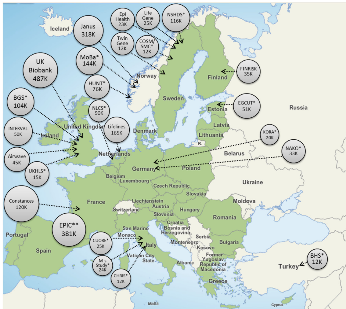
Fig. 2 Prospective European cohorts with at least 10,000 participants and including baseline collection of biological samples. *Cohort acronyms by country: Estonia: EGCUT = Estonian Genome Centre, University of Tartu; Germany: KORA = KOoperative gesundheitsforschung in der Region Augsburg, NAKO = German national cohort; Italy: CUORE = Cohort of Italian Adult Women and Men, M-s study = Moli-sani Study, CHRIS = Cooperative Health Research in South Tyrol Study; Netherlands: NLCS = Netherlands Cohort Study; Norway: MoBa = Norwegian Mother and Child Cohort Study, HUNT = Nord-Trøndelag Health Study; Sweden:

NSHDS = Northern Sweden Health and Disease Study, COSM/SMC = Cohort of Swedish men/Swedish Mammography Cohort; Turkey: BHS = Balçova Heart Study; United Kingdom: BGS = Breakthrough Generations, UKHLS = The UK Household Longitudinal Study. **EPIC (The European Prospective Investigation into Cancer and Nutrition) includes the following centres: EPIC-Denmark (56 K), EPIC-France (20 K), EPIC-Germany (Potsdam & Heidelberg) (50 K), EPIC-Greece (28 K), EPIC-Italy (47 K), EPIC-Netherlands (36 K), EPIC-Norway (9 K), EPIC-Spain (39 K), EPIC-Sweden (53 K), and EPIC-United Kingdom (43 K)