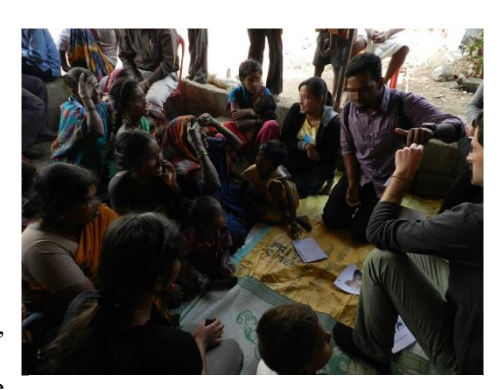
Figure 3. Animated prioritization workshop in front of a tea-shop in Peenya

In order to ensure that the community had a consistent presence and voice regarding the direction and focus of the project, and to avoid a prolonged absence from Peenya and Sumanahalli, regular community forums were held in the slums (Figure 3). The main aims of these forums were to discuss with slum residents the information gathered thus far, to define priorities for the project and the ICSs, and to decide upon ways of meeting these priorities. We recounted with them smoke-related discomforts, fuel accessibility and cost,