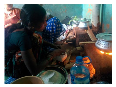
Figure 5. Two participants using and discussing the characteristics of two different prototypes

consent of local slum leaders. There, rather than introducing a 'foreign' product, far from the 'ideal' versions of stoves built during the foam modelling workshops, we encouraged slum residents to build several chulhas similar to the ones used in their own homes. From this starting point, the designers made small, cumulative technical modifications to the chulhas . These changes were complemented upon during workshops by feedback from people in the slum, who were encouraged to