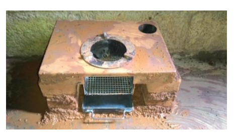
Figure 8. Two designs: The first, (top) built for maximum visibility released more pollution, and the second (bottom) contained the smoke better but conferred poorer visibility of flames during cooking

we should add small knobs around the prototypes' hob, onto which the vessels would rest during cooking- a component they normally added on their traditional stoves. The users' reasoning for this addition was that the fire needed to escape from the stove chamber and engulf the sides of the pot for an increased efficiency. It could also be argued that this space would permit an air channel within the fully enclosed traditional clay chulha. On the prototype they were using, however, the required oxygen supply was provided through the inner workings within the stove chamber which were