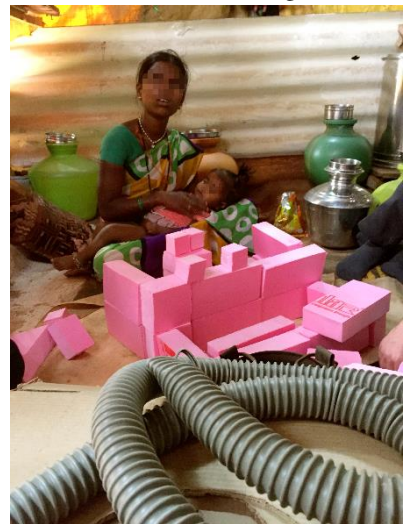
Figure 4. Participant building 'ideal' stove from foam bricks and other materials

ICS by employing visual cues of concepts. However, the conceptualization exercises led to little progress and proved to be too abstract and ineffective, necessitating the use of more tangible approaches. We asked the participants to build 'ideal' stove prototypes with the use of foam bricks, plastic pipes and cardboard (Figure 4). However, we observed that the 'ideal' stoves built were mere reflections of the chulhas the residents of Peenya and Sumanahalli slums were currently using, which, the designers reasoned, was due to the slum inhabitants' internalization of the cooking equipment and cooking experience over the course of many years of practice. In spite of the initial difficulties in finding