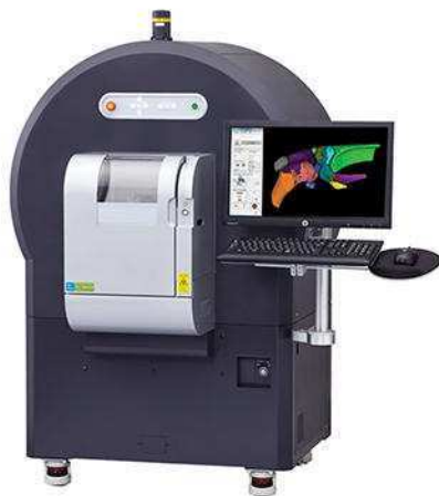
Quantum GX2 microCT

THE MORE YOU IMAGE THE MORE YOU UNDERSTAND