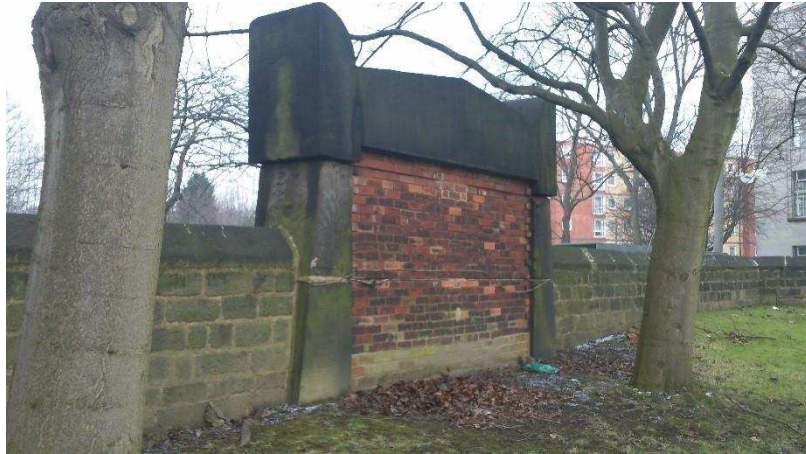
FIGURE 4. Free-standing Arch in St George's Field 2014. This arch is close to the Henry Price Halls of Residence, which overlooks the cemetery. At the top on the left you can see under the overhang of the building and directly on the left is the original wall of the cemetery on which the halls sits in a cantilever effect.

that they no longer provide entrances to the space (one is blocked in with bricks and the other is placed within the actual cemetery boundary for decorative purposes), consequently adding to the hiding of the cemetery (see figure 4 and 5).