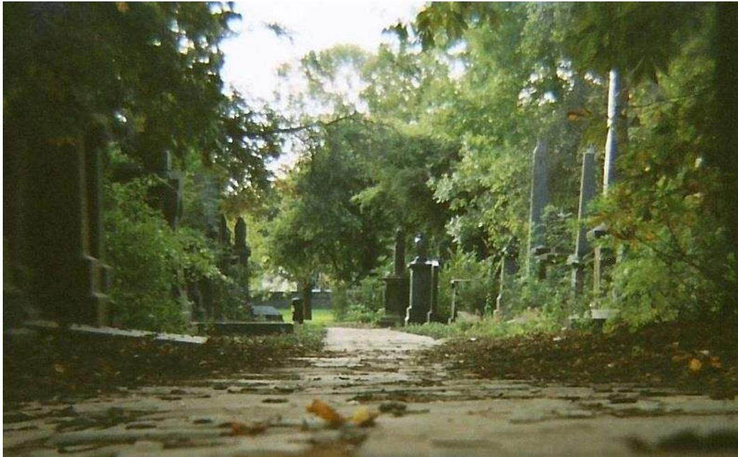
FIGURE 1. Some of the remaining headstones and memorials in a section of St George's Field. These grave markers are located either side of a path in the north part of the cemetery.

This article will discuss what I describe as an act of ‘hiding’ that goes to the very bones of the discourse of the university in regards to the burial ground. I maintain that at the time of the acquisition, this hiding was around the concept of creating order out of chaos, since the cemetery was in a very poor state. However, in subsequent years the hiding has changed to one of a reluctance to openly share and discuss the heritage of the space, since this also means an exhumation of the disputes that occurred at this time. While the university is happy to celebrate the heritage of the modernist buildings from the 1960s (a number which now have heritage status), the cemetery is not celebrated at all and not even considered to be a heritage site by the university, despite having a blue plaque outside it and a few within the space itself, which are dedicated to specific individuals of note.