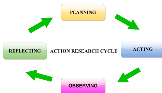
Figure 1. Action Research Cycle

Cyclical process that takes shape as knowledge emerges. Cycles converge towards better situation understanding and improved action implementation; and are based in evaluative practice that alters between action and critical reflection. Action research can therefore be seen as an experiential learning approach to change.