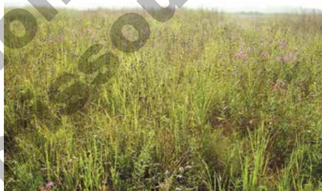
Figure 1. Forbs and legumes can be established with stands of native warm-season grasses to improve their value for wildlife and pollinator habitat.

Fields with diverse vegetation typically attract a greater variety of wildlife than monoculture, or single species,