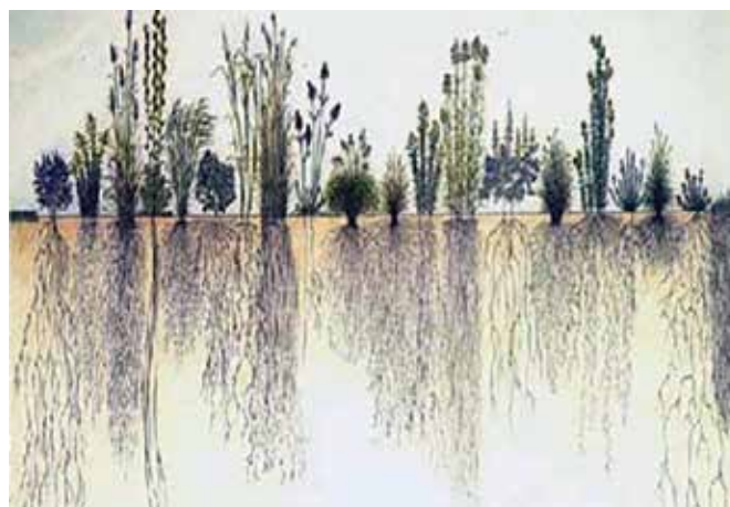
Figure 2. Native grass, forb and legume mixtures help maintain soil health, improve soil organic matter and prevent nutrients from infiltrating adjacent streams. Note the soil depth comparison of the root system of Kentucky bluegrass on the far left with the root systems of a variety of native forbs and warm-season grasses.