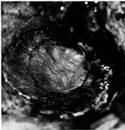
Fig 1.—Fascia graft in place. Argon laser spots are visible immediately after irradiation.