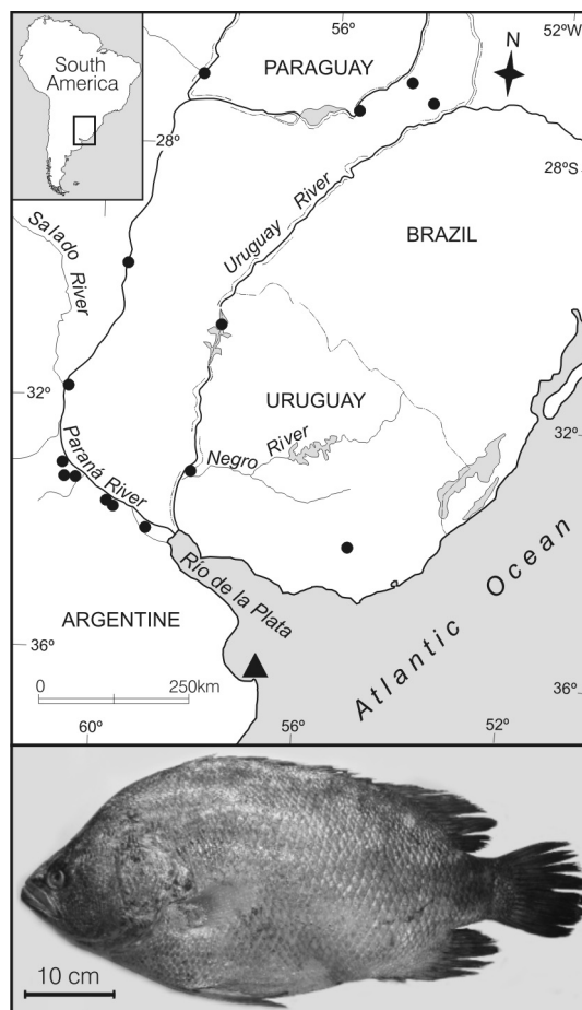
Fig. 1. ▲ First record of Oreochromis niloticus in the Samborombón Bay (36° 17' S - W 36° 46'), ● aquaculture fisheries of O. niloticus in the Paranoplatense Basin.

The specimens caught measured 600, 580, 450 and 290 mm in total length and 4,900, 4,010, 2,350