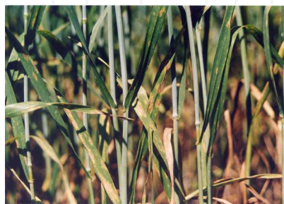
Fig. 3. Symptoms of tan spot (Moreno & Perelló 2010)

P. tritici-repentis can also infect wheat seed during the grain filling period (Schilder & Bergstrom, 1994). This disorder is called red smudge because infected seed has a reddish discoloration (Valder, 1954).