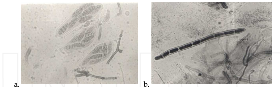
Fig. 1. a: Asci with ascospores b: conidia of P. tritici-repentis (= D. tritici-repentis ) (Moreno 2007)

straw-coloured, smooth, thin-walled, with 1-9 (usually 5-7) pseudosepta, old conidia often constricted at the pseudosepta, 80-250 (117) \mu lon, 14-20 (17.7) \mu thick in the broadest part, 2-4 (3) \mu wide at the base (Figure 1b). (Ellis & Waller, 1976).