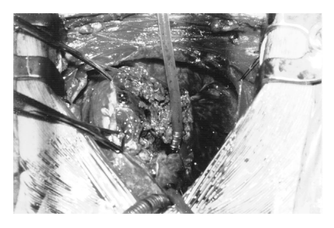
Figure 1. Right atrial cardiac angiosarcoma.