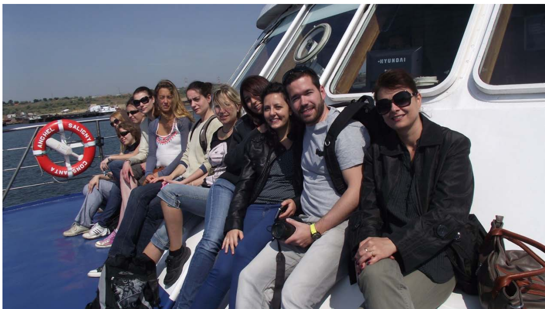
Figure 2 – Social excursion for the course participants and lecturers aboard the “Anghel Saligny” vessel