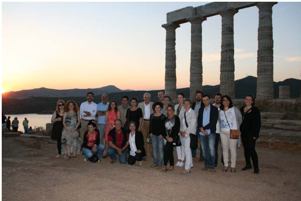
Figure 8 - Group photo of the Anavyssos Summer School participants