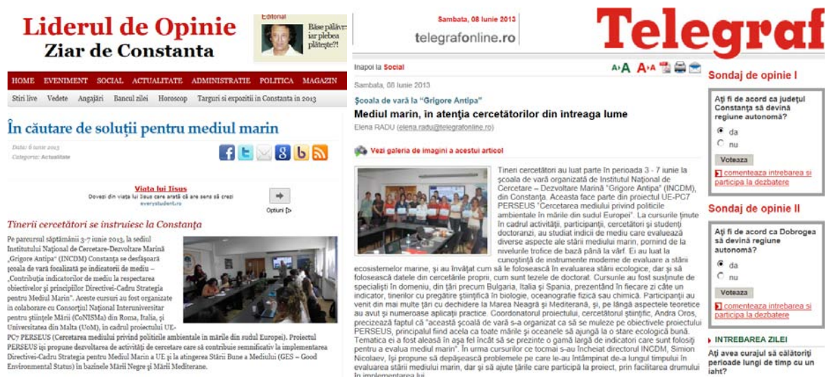
Figure 5 - Excerpts from the news articles