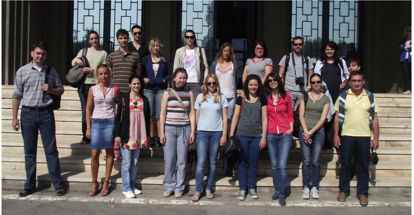
Figure 1 - Group photo of the PERSEUS Summer School participants