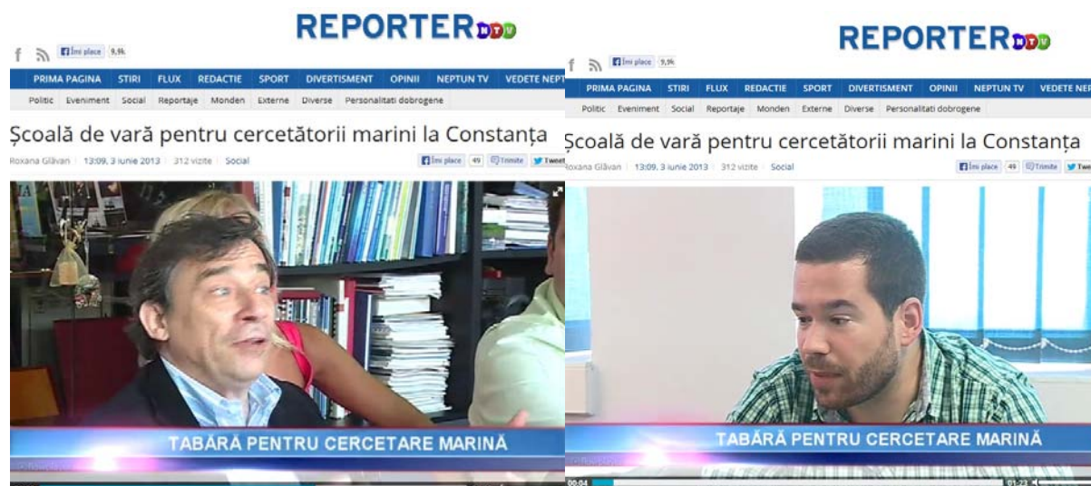
Figure 4 - Snapshots from the video material

5. Perseus Summer School Closing Day article www.telegrafonline.ro (most read local newspaper of Constanta) THE MARINE ENVIRONMENT, FOCUS OF RESEARCHERS WORLDWIDE http://www.telegrafonline.ro/1370638800/articol/236768/mediul_marin_in_atenti_a_cercetatorilor_din_intreaga_lume.html