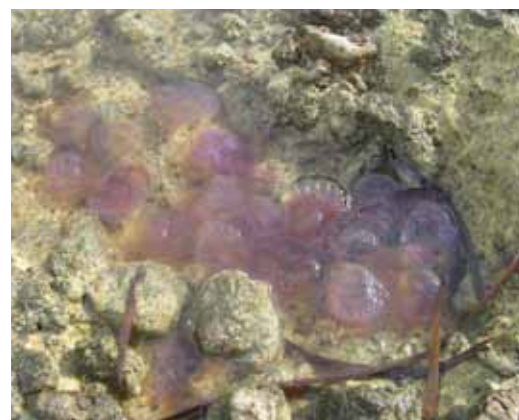
The Mediterranean Sea is witnessing an influx of warm-affinity jellyfish species, like the upside-down jellyfish Cassiopea andromeda (top and bottom left). Jellyfish blooms, such as the mauve stinger Pelagia noctiluca (shown beached, bottom right) are also increasing in frequency in the Mediterranean Sea.

number of submerged valleys, known as grabens – the Pantelleria Graben, the Malta Graben and the Linosa Graben, where the sea depth reaches a maximum of 1,700m (Reuther & Eibacher 1985).