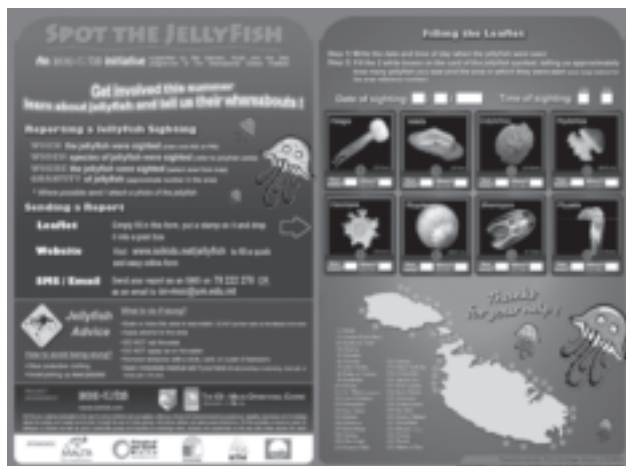
Figure 5. The ad hoc Spot the Jellyfish initiative reporting leaflet.

Jellyfish spotting initiatives are relatively common on a global and regional scale. The Monterey Bay Aquarium hosts an on-