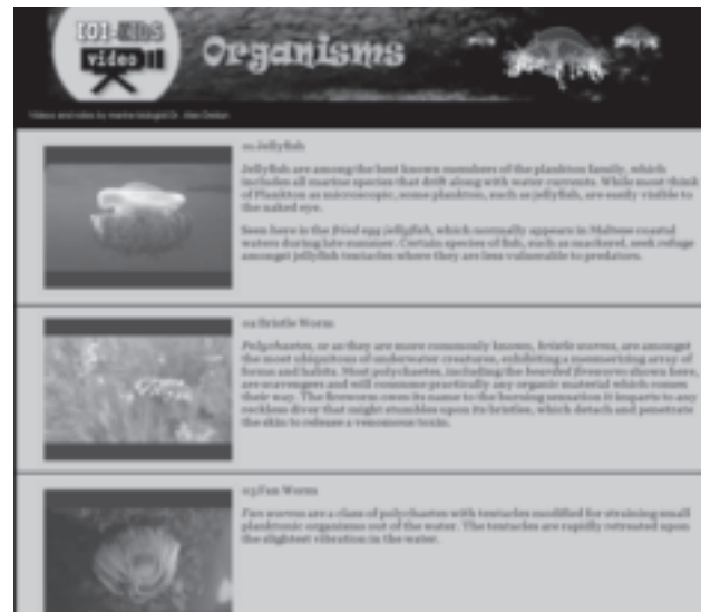
Figure 4. The video clips section of the IOI-KIDS website.

Experts on marine and coastal affairs, such as marine educators, popular science authors, and representatives of educational, environmental NGOs and other organizations, are encouraged to contribute to this section. This “Info 4 Kids” theme constitutes