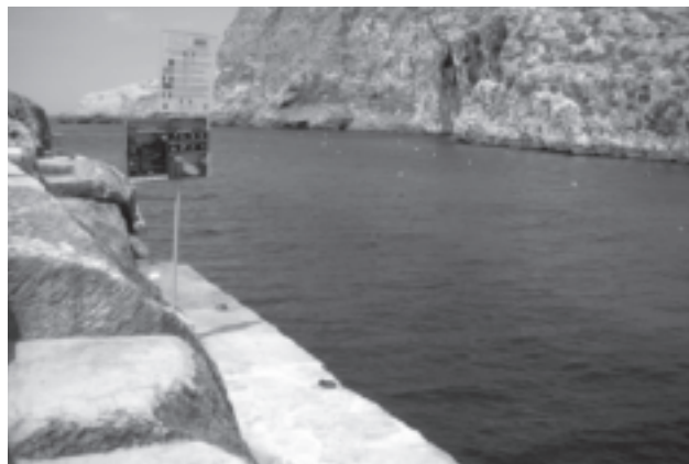
Figure 6. Spot the Jellyfish posters affixed at a coastal site in the Maltese Islands