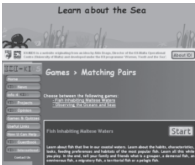
Figure 1. Screenshot of the Matching Pairs game.

Moreover, the website provides a framework and prolific medium for kids and educators to exchange opinions, share ideas, projects and experiences, and to join in virtual dialogue on topics relating to the marine environment. This functionality is expected to evolve in the future by further developing the IOI-KIDS website in line with state-of-the-art web technology that enables direct input of content by the users, such as through forum space or conducting online surveys. This will promote interaction between teachers, students, and schools. The content of all submitted material will be vetted by a validation team composed of a biologist and a teacher prior to online hosting. The names of the professionals that form part of this validation team will be visible on the website.