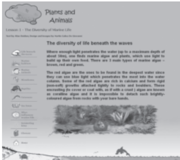
Figure 3. An online lesson giving an overview of marine floral and faunal species.

IOI-KIDS is organized to enable easy access to its various components from different entry points. In its current format, the website is composed of the following key sections: