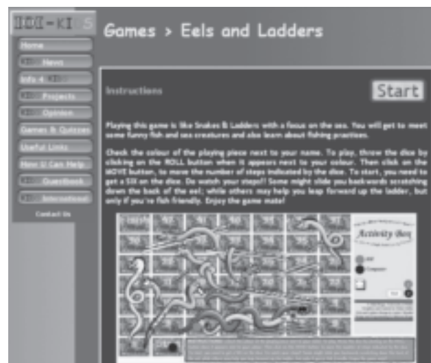
Figure 2. The Eels and Ladders game.