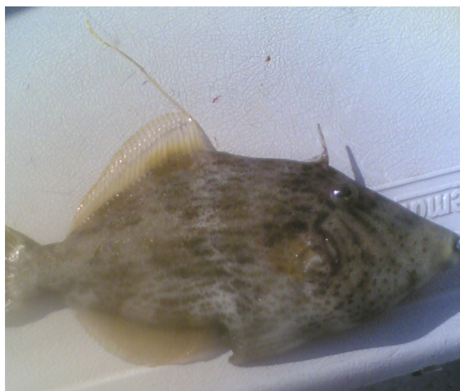
Figure 3. Specimen of Stephanolepis diaspros caught off the island of Lampedusa