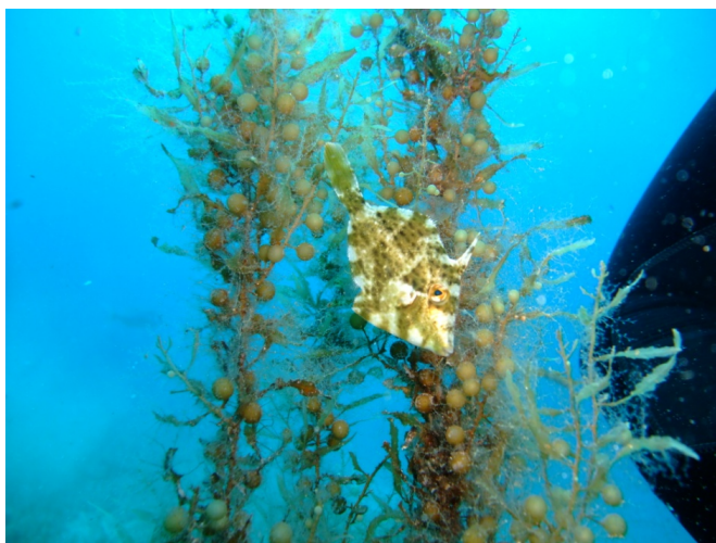
Figure 2. Stephanolepis diaspros photographed at a depth of 34m at Cirkewwa, Malta.

The specimen of S. diaspros caught in coastal waters of the island of Lampedusa and shown in Figure 3 exhibited a greyish colour laterally, with dark green striations radiating downward from the eye across the cheek, with dark green speckles on the cheek, and green-yellowish patches along body sides, the fins were pale yellow, the soft dorsal one centrally transparent with pale yellow borders and with a light brownish patch anteriorly, with the 2 nd ray extended in a long filament.