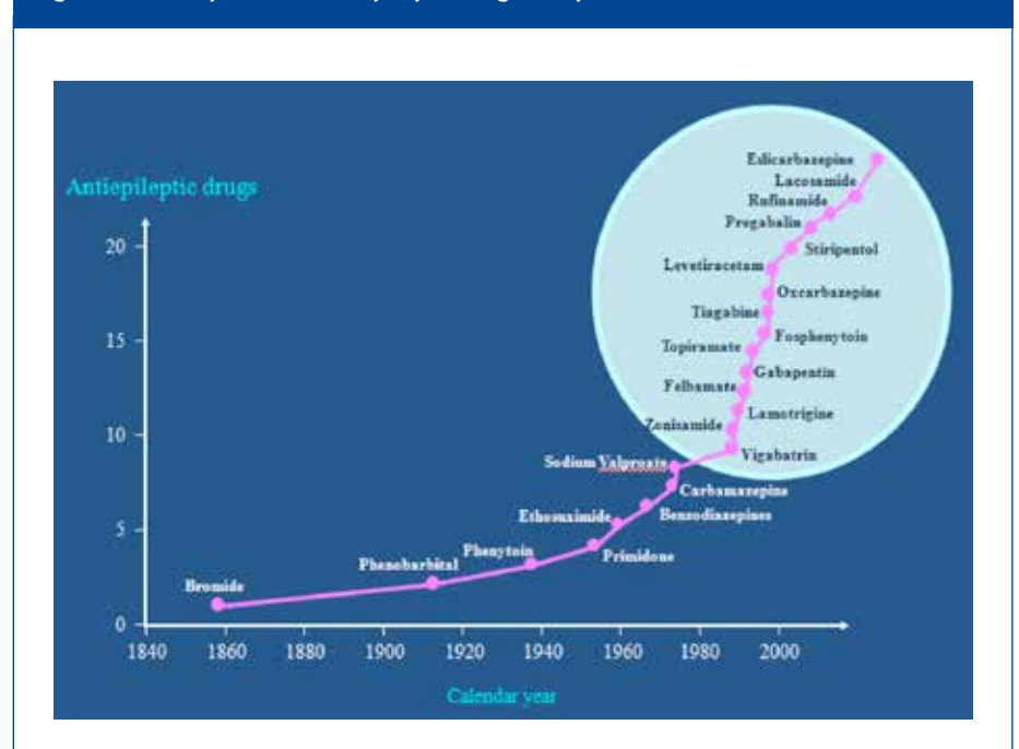
Figure 2: Development of Antiepileptic drugs. Adapted from Brodie, 2010 8

Felbamate was approved by FDA to be used in United States in 1993. It shows efficacy in Lennox-Gastaut syndrome and partial seizures in children. 10 Aplastic anemia and hepatic failure are life-threatening adverse side effects of felbamate. Gabapentin was approved in 1993 as adjunctive therapy in the treatment of partial seizures with or without secondary generalization as adjunctive therapy in patients 3 years and older. It is also effective in some children with refractory partial seizures and in controlling seizures associated with benign childhood epilepsy with centrotemporal spikes. 11 Lamotrigine (LTG) was approved in the USA in 1994 for the treatment of focal seizures, then in 1998 it was approved to be used as adjunctive treatment of Lennox-Gastaut syndrome. LTG is now considered as first line drug for focal seizures and generalized tonic-clonic seizures. Oxcarbazepine was approved in 2000 for the treatment of partial-onset epilepsy as monotherapy or polytherapy in patients aged 4 years or older.