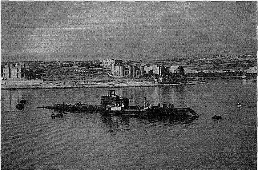
HMS Olympus at the Lazaretto submarine base.

In early 1941, it was decided to move 10th flotilla to the safety of Alexandria. Too many submarines had suffered in Malta including the