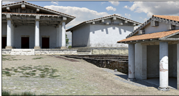
Fig. 1 – Virtual simulation of the Sanctuary of the acropolis during the Hellenistic period.

element, since most of the fragments, unearthed during previous excavations, are not directly available for an accurate reconstructive hypothesis.