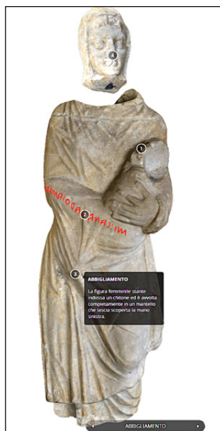
Fig. 3 – 3D model of the Kourotrophos Maffei (Museum Guaracci) with annotations, as seen in Sketchfab.