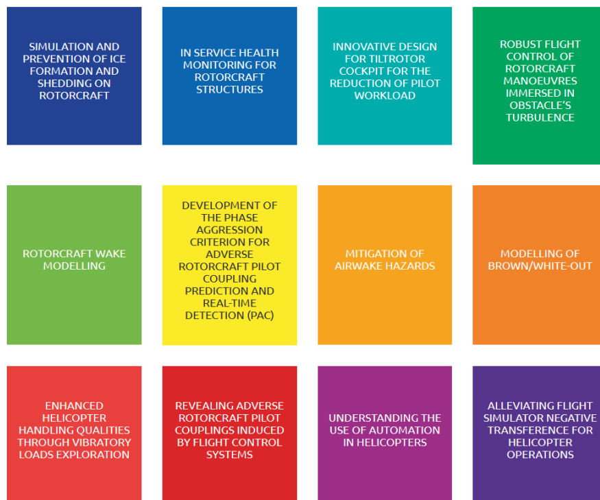
Figure 1: The 12 research projects that will be pursued by NITROS researchers.