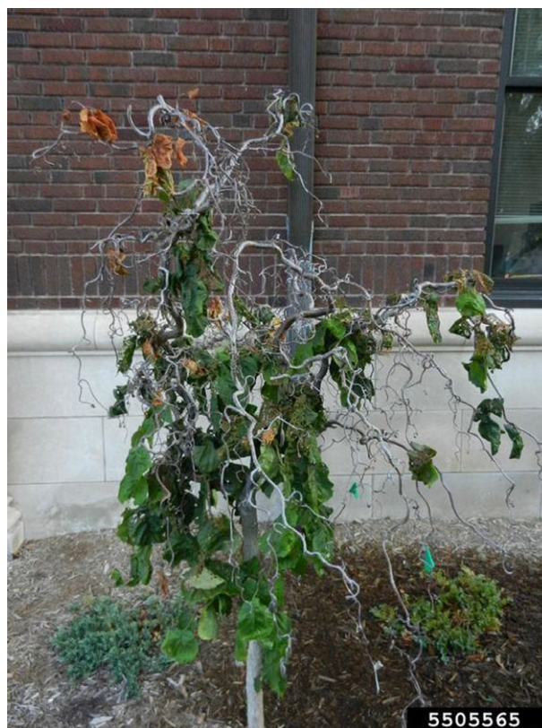
Figure 3: Symptoms of Anisogramma anomala on ornamental Corylus avellana .