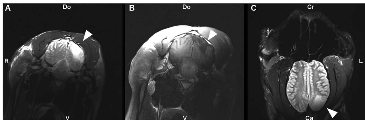
FIGURE 2 MRI images of a brain infarct attributed to a catheter-associated air embolism. A, T2-weighted image in the transverse plane at the level of the tympanic bulla. B, T1-weighted transverse image just cranial to (A). C, T2-weighted image in the dorsal plane at the level of the frontal sinuses. The lesion predominantly affects the left occipital lobe, but extension across the midline is evident. Abbreviations: R, right; L, left; do, dorsal; V, ventral; cr, cranial; ca, caudal