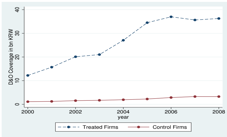
Figure 2: The graph plots the yearly average of D&O insurance coverage for the treatment and the control group in sample in the period 2000-2008. The blue line in the graph shows average D&O insurance coverage for Treat firms and the red line for Control firms.