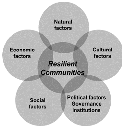
Figure 1: Conceptual framework for analysing resilient communities