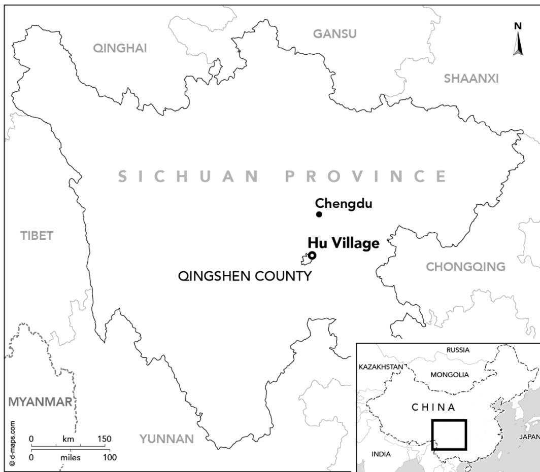
Figure 2: Location of Hu village in Sichuan Province