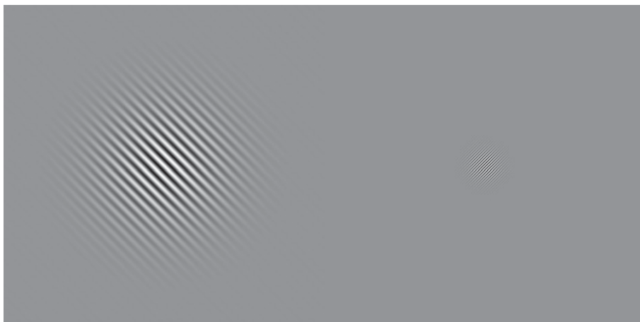
Figure 1. Examples of Gabor gratings representing low (1 cpd), mid-range spatial frequencies (4 cpd), at the two orientations used.

constituting of no more than 35 days, and no breastfeeding or use of emergency contraception or hormonal contraceptives 3 months prior to testing. Participants using combined oral contraceptives were required to meet the same criteria regarding cycle length.