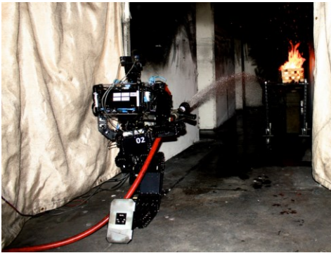
Fig. 3. SAFFiR [14].