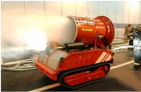
Fig. 2. LUF60 [13].

smoke from burning buildings with a high-powered fan. It is also able to spray water mist or foam from 60m and blast water for 90m. Remote control and operation can be facilitated up to 500m away to send the robot into environments hazardous to firefighters.