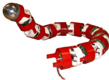
Fig. 1. The SnakeFighter Anna Konda [11], [12].

The SnakeFighter Anna Konda [11], [12] shown in Fig. 1 is able to push against external obstacles apart from a flat ground and capable of obstacle-aided locomotion and extinguishing fire using a nozzle mounted at the front of the robot, with hydraulic medium in the joint actuation. A combined utilization of water is realized for hydraulic joint actuation, fire extinguishment and robot cooling under high temperature.