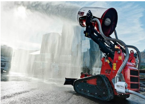
Fig. 4. TAF 20 [16].

Thermite 3.0 [17] is a small firefighting robot is capable of fitting into restricted space. It has integrated multiple HD analogy video cameras and optional Infrared (IR) FLIR. As an electrically powered Unmanned Ground Vehicle (UGV), FIREMOTE [18] can be remotely operated through a control panel and tracked outside the dangerous area. The control panel has a daylight viewable monitor that a software dashboard can be displayed with the robot's parameters as well as video feedback for navigation. FIREMOTE is equipped with a monitor, colour navigation camera, local