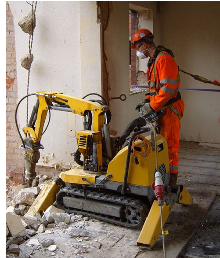
Fig. 5. Brokk50 [20].

cooling system and variable pattern nozzle. ArchiBot-M [19] has an independent suspension system. It is capable of ascending and descending stairs and working under high temperatures, since it is waterproof and equipped with a cooling system. More interestingly, the Sweden-made firefighting robot Brokk50 [20] is capable of forcible entry, rescue, excavation, notching, carrying payload within unsafe or extreme environment.