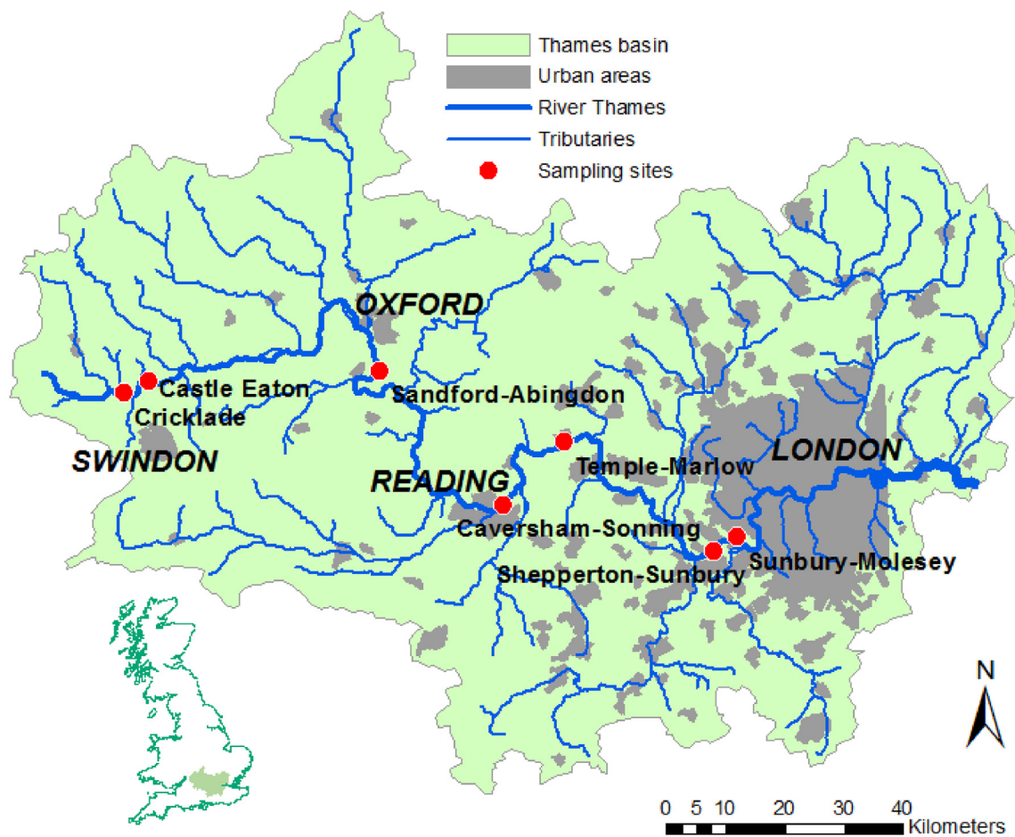
Fig. 1. Map showing locations of sampling sites on the River Thames. Sampling was undertaken in the stretch between locks (detailed by the site name) and therefore markers are placed approximately between the two locks, except for Cricklade and Castle Eaton where there are no locks and the markers denote the exact sampling location. See Table 1 and Table S2 for further details on sampling sites. The main urban centres are also marked.

of particles (22/44) were analysed by Raman spectroscopy (HR800UV, Jobin Yvon Horiba, France, with integrated Olympus BX41 microscope) using Horiba LabSpec 6 software to give a qualitative representation of chemical composition of the microplastic particles as per Horton et al. (2017). It was not possible to analyse all particles as some were lost following quantification due