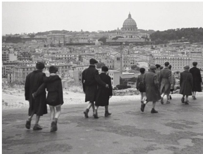
Figure 1: The final shot of Roberto Rossellini's Rome Open City .

Rome Open City 's ending to be inherently—indeed deliberately—ambiguous. 3 My interpretive wager, however, is that it is possible to adjudicate between the competing critical camps and to arrive at a more persuasive—not to say definitive—analysis of the film's final shot. It is thus my aim in this brief essay to explore several conjectures that, if I am correct, may yield new insights into the implications and connotations of the conclusion to Rossellini's post-war masterpiece. Since that masterpiece has often been made to serve not just as an expression but also as a virtual embodiment of its historical moment, and has even been credited with changing the course of Italian history, the search for new insights into its conclusion takes on added importance. 4