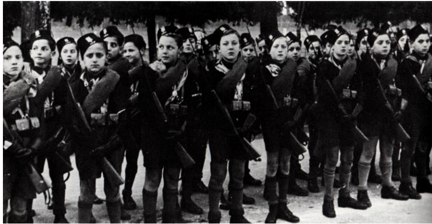
Figure 3: Balillas in Rome.

(Youth), images of marching youths like the one that closes Rossellini's film had been far from uncommon (See Figures 3-4). However much Rome Open City worked to reclaim them, it is difficult to imagine that such images could be seen as entirely positive, entirely encouraging, or entirely straightforward. It is difficult to imagine, as well, that the director and his collaborators could have ignored the cultural baggage of the imagery they adopted.