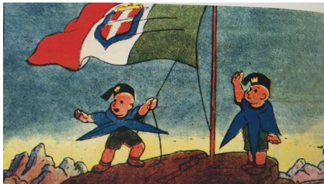
Figure 5: Romolino and Remoletto, detail