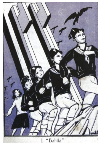
Figure 4: Balillas depicted in a 1935-36 school diary.

My second conjecture, in fact, is that in constructing the film's conclusion Rome Open City 's creative team knowingly drew on Fascist representations of youth in order subtly to signal the lingering influence, and with it the lingering threat, of Fascism after the war. It is widely recognised that Rossellini and his collaborators attempted something similar with the third film of what has come to be known as the neorealist trilogy, Germany, Year Zero