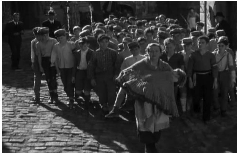
Figure 2: The final scene of Frank Borzage's No Greater Glory .

disfatta di Satana , argued that three deaths were already too many and that a fourth, the death of a child, would make the film too maudlin. Rod Geiger, who helped to produce the film, likewise proposed a happier ending to increase the film's appeal to an American market. The screenwriter Sergio Amidei, in turn, advocated an uplifting ending for ideological reasons, in order to hold to the political line advanced by the Italian Communist Party. 9 Rossellini, in contrast, is thought to have wanted his film to be more "politically ambiguous." 10 There was evidently a struggle over the film's conclusion, therefore, which may help to explain the ambiguity that some have identified in its final shot.