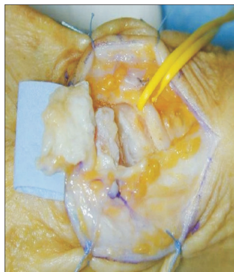
Fig. 2. U-shaped incision prepared for the surgical procedure: abductor pollicis longus dissected proximally at the snuffbox.

All the patients included were evaluated during the usual checks in the first post-operative month for dressing and K. wire removal; than after 3 and 12 months post-operative with X-Rays check. In 2013 we revised all the patients enrolled at an average 6.8 years follow-