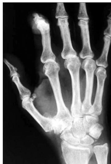
Fig. 3. Clinical case 1- pre-op x-Ray.