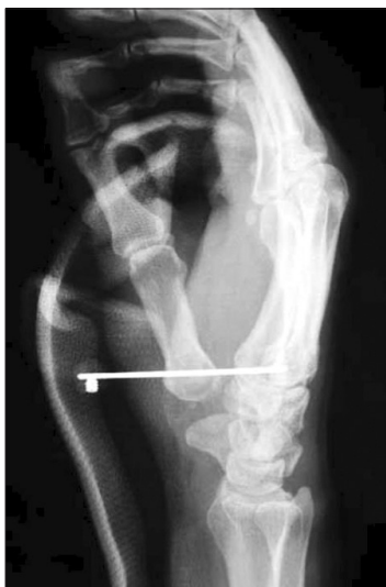
Fig. 4. Clinical case 1- post-op x-Ray - see K wire position in light distraction (usually a temporary rolled wet gauze 5 x 5 cm is placed between the metacarpal and the scaphoid after trapeziectomy with K wire insertion).