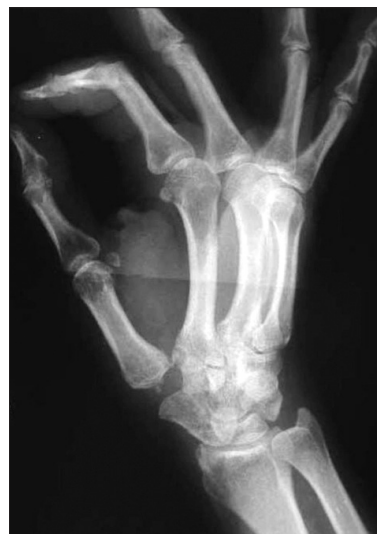
Fig. 5. post-op x-Ray follow-up at 5.5 years.

up (range, 3-10 years). The mean follow-up of the two groups was similar; in particular 7 years (range, 3-10 years) for the group treated with trapeziectomy and interposition arthroplasty, and 6.6 years (range, 3-10 years) for the group treated with trapeziectomy with K. wire suspension.