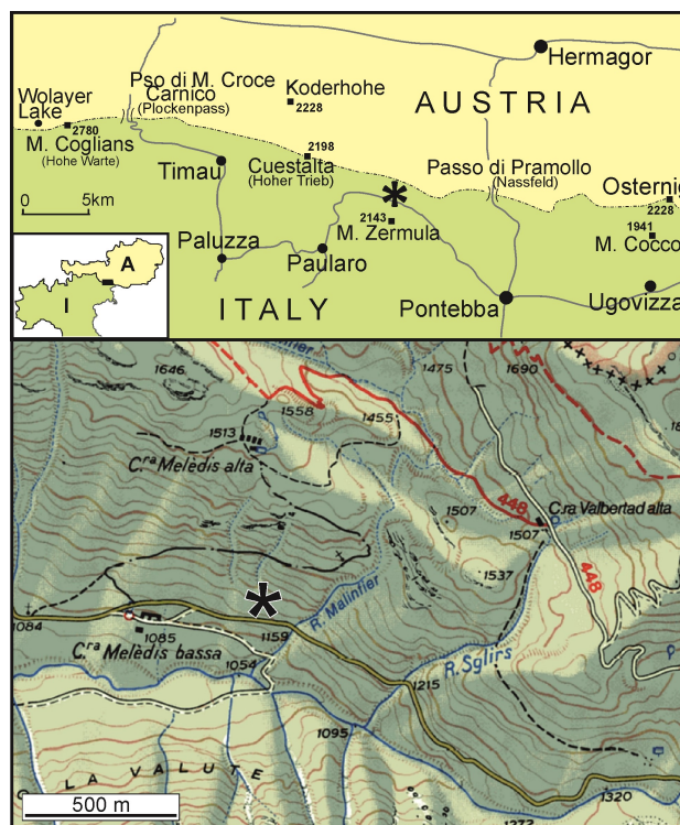
Figure 1. Location map of the Rio Malinfier West section.

The section is partly overturned and strongly tectonized, and documents about 100 m of limestones and black shales attributed to the Alticola, Rauchkofel, La Valute, Nölbling and Findenig formations (Figs. 2-3). The section is divided in two parts approximately about 40 m from the base by a north dipping roughly E-W trending fault. While in the footwall of the fault the succession is fairly undisturbed, with just very gentle folding and a minor fault, the hangingwall is characterized by a tight inclined decameter-scale syncline associated to smaller-scale asymmetric folds, in turn gently folded by a larger-scale structure.