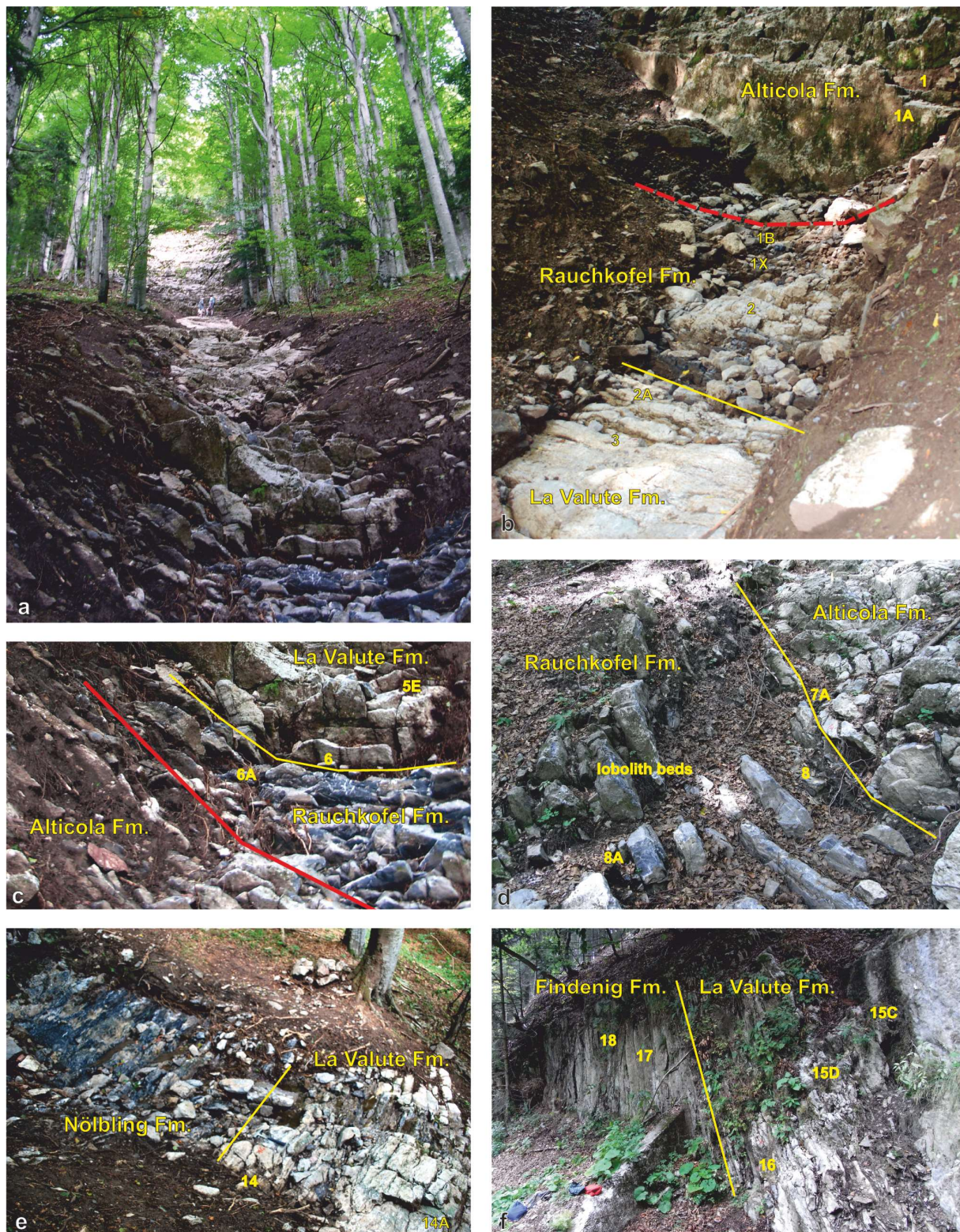
Figure 2. Views of the Rio Malinzier West section, with indication of the lithostratigraphic units and position of samples. A. Panoramic view of the topographically upper part of the section; B. The lowermost part of the section with the tectonic boundary between the Alticola and the Rauchkofel formations, and the transition to the La Valute Fm.; C. The roughly E-W trending fault separating the Rauchkofel and the Alticola formations in the central part of the section; D. The transition from the Alticola to the Rauchkofel formations in the central part of the section, and the lobolith beds; E. The sharp boundary between the Nölbling and La Valute formations; F. Gradual transition from the La Valute Fm. to the Findenig Fm. in the uppermost part of the section.