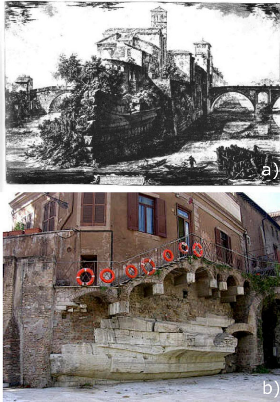
Fig. 4. Tiberina Island geomorphosite, Rome, an example of landform conservation.

a) the boat shaped isle embankments during the Roman period in a painting by G.B. Piranesi (18th century); b) the embankments nowadays.