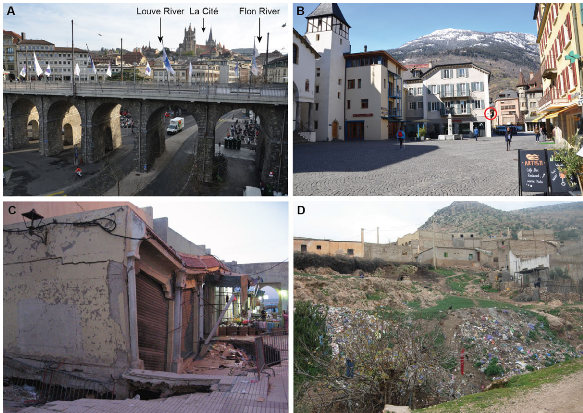
Fig. 2. Example of relationships between geomorphology and urbanization.