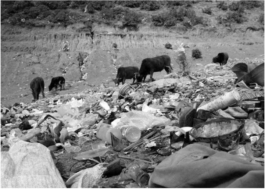
Figure 11: Garbage dumped by Liege Village.

made more and more money, and they began to use more and more industrial products in their daily lives, such as washing powder, shampoo, plastic shoes, etc., which are signs of civilization, development, progress, and so on. As a consequence, more and more non-biodegradable garbage appeared. The villages are at the bottom of “food chain”; they can’t find their own downstream for dumping their own garbage, and can only dump their garbage on their own mountain.