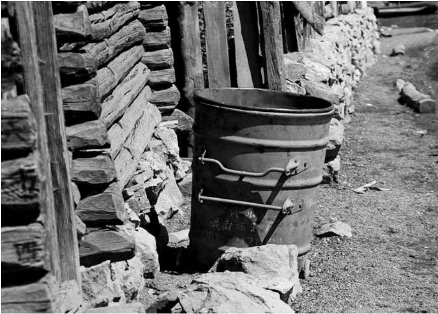
Figure 10: Garbage can at the center of the previous photo.

Lake Lugu. I asked her to find the places where Lige and Luoshui (落水) dump their garbage. Luoshui is another Nari village close to Lige. It is the first village there that developed tourism, and therefore is the richest village around Lake Lugu. It had Internet bars even before 2000.