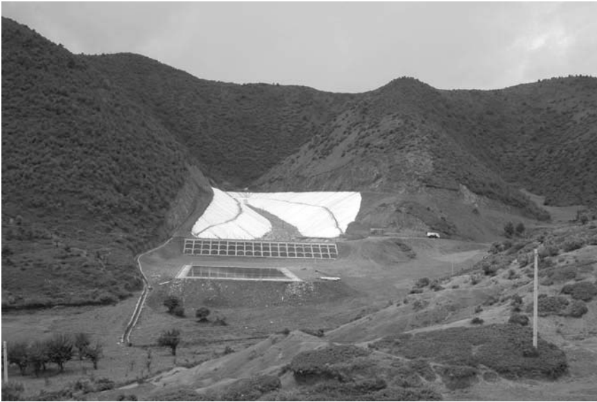
Figure 14: The garbage dump of Yongning in a mountain valley near Lake Lulu. Photographed on August 19, 2008

originally people's way of life. When these were made into the resources of tourism, people began singing and dancing for money, with the result that these activities became not life itself, but a performance of life. When people make money, they want to live in increasingly modern ways; they no longer live as before, but as people in modern areas far from the village. Their singing and dancing lose authenticity and become a staged performance. This means that the deepest resources they used for development are actually lost. This is a palpable shrinking at the "spiritual" level.