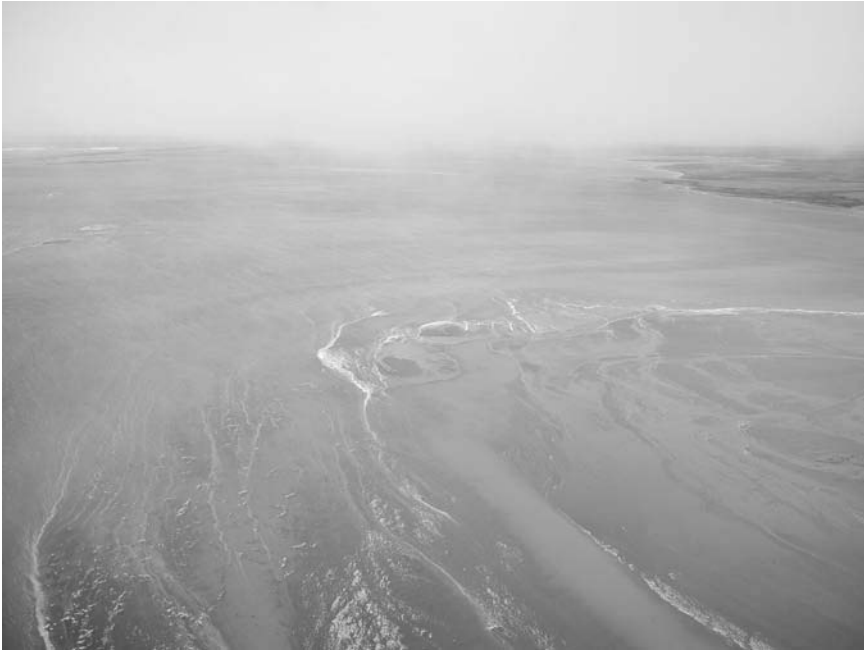
Figure 6: Subhankar Banerjee, Storm over Kasegaluk Lagoon, along the Chukchi Sea coast , 2006

the suspension of presence.” Nancy continues, “this suspension is always a question of passage, or a passing on. A landscape is always a landscape of time, and doubly so: it is a time of year (a season) and a time of day (morning, noon, or evening), as well as a kind of weather [ un temps ] rain or snow, sun or mist. In the presentation of this time ... the present of representation can do nothing other than render infinitely sensible the passing of time, the fleeting instability of what is shown” (Nancy, “Vestige” 94). Among other things, what is “shown” in its fleeting instability is depopulation itself, the voiding of human presence as the condition of landscape—a point echoed by Banerjee in his attention to the complicity of traditional landscape photography with a dialectic of colonial expansion and aesthetic preservation of “untrammelled wilderness.” Thus depopulated, landscape projects itself as a realm of purely natural temporality; but it is nevertheless frozen or suspended into a singular moment by artistic representation, arresting the very temporality to which it would bear witness in its claim to be devoid of human presence. The uncanniness of landscape identified by Nancy in the very origin of the genre—both its originary “depopulation” of the country and its paradox-