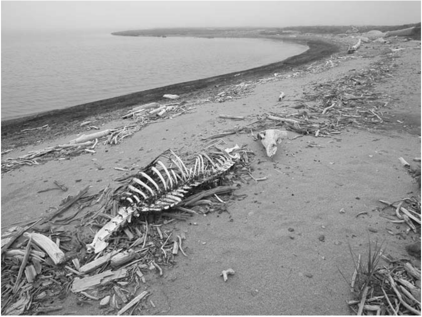
Figure 2: Subhankar Banerjee, Caribou Skeleton , Barter Island in the Arctic National Wildlife Refuge, 2006

conditions that mark the circulation, display, and reception of the photograph on the other.