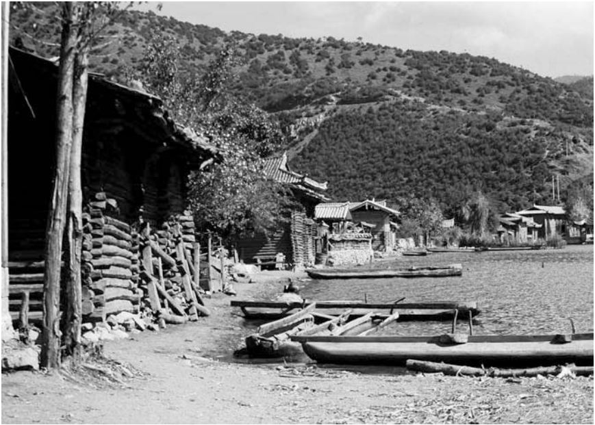
Figure 9: The entrance of Lige. Note that there is a garbage can in the center of the photo. October 2000.

and energy. Being located in the downstream or mid-stream of the global modernization “food chain” is the background of all problems in non-modernized or sub-modernized countries and areas.