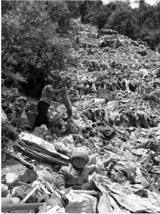
Figure 13: Garbage hill: six years of garbage from Luoshui village. May 21, 2004.

nasty, and they always drank lake water directly. But in 2000, I was told in Luoshui that the water close to shore was not drinkable, and people had to draw a boat to the center of the lake to take drinkable water.