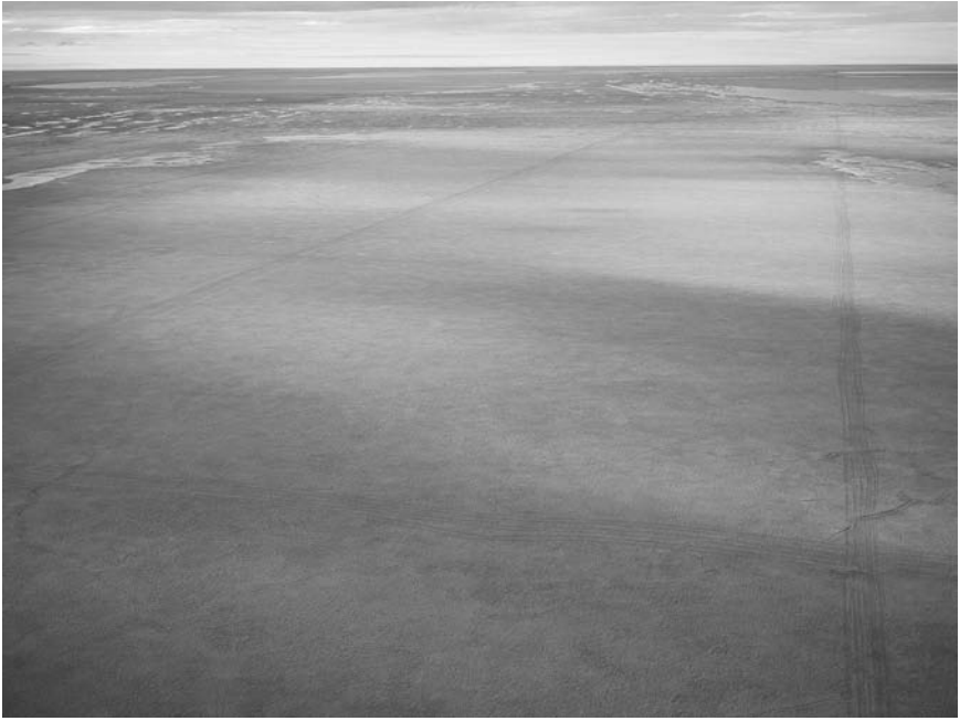
Figure 4: Subhankar Banerjee, Known and Unknown Tracks , Teshekpuk Lake Wetland, 2006