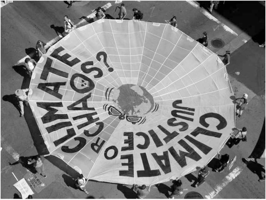
Figure 7: “Climate Justice or Chaos?”

campaign associated with the Live Earth concerts and its accompanying Global Warming Survival Guide —indigenous activists have recoded survival as a biopolitical rights-claim that seeks redress for the uneven allocation of climate-related vulnerability along already-existing lines of marginality and disenfranchisement. 17 As Banerjee himself puts it during a presentation of his work with Gwich’in activist Sarah James at Klimaforum09, “climate change is a great human rights issue ... right to survival is one of the first rights people should have—access to their food, access to their water—and that’s being seriously threatened up in the Arctic” (Interview with Amy Goodman). The right to survival invoked by Banerjee is irreducible to a question of sheer material resources, for the latter—hunting for instance—are themselves inscribed in specific cultural repertoires, technical practices, and ecological knowledges that make up a kind of ethnomnemonic archive that is itself threatened by climate-related displacements such as that with which Shishmaref is currently undergoing (Sutter). Thus a certain survival of historical memory is inextricable from the survival of living beings. However, historical memory is not only a matter of a cultural tradition in the limited sense; it is also a kind of bear-