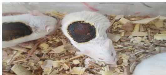
Figure 1. Third-degree burn in male mice.

kept the coin 8 second on the above-mentioned area of skin consequently similar strong burns were generated as thermal burns (Figure 1).