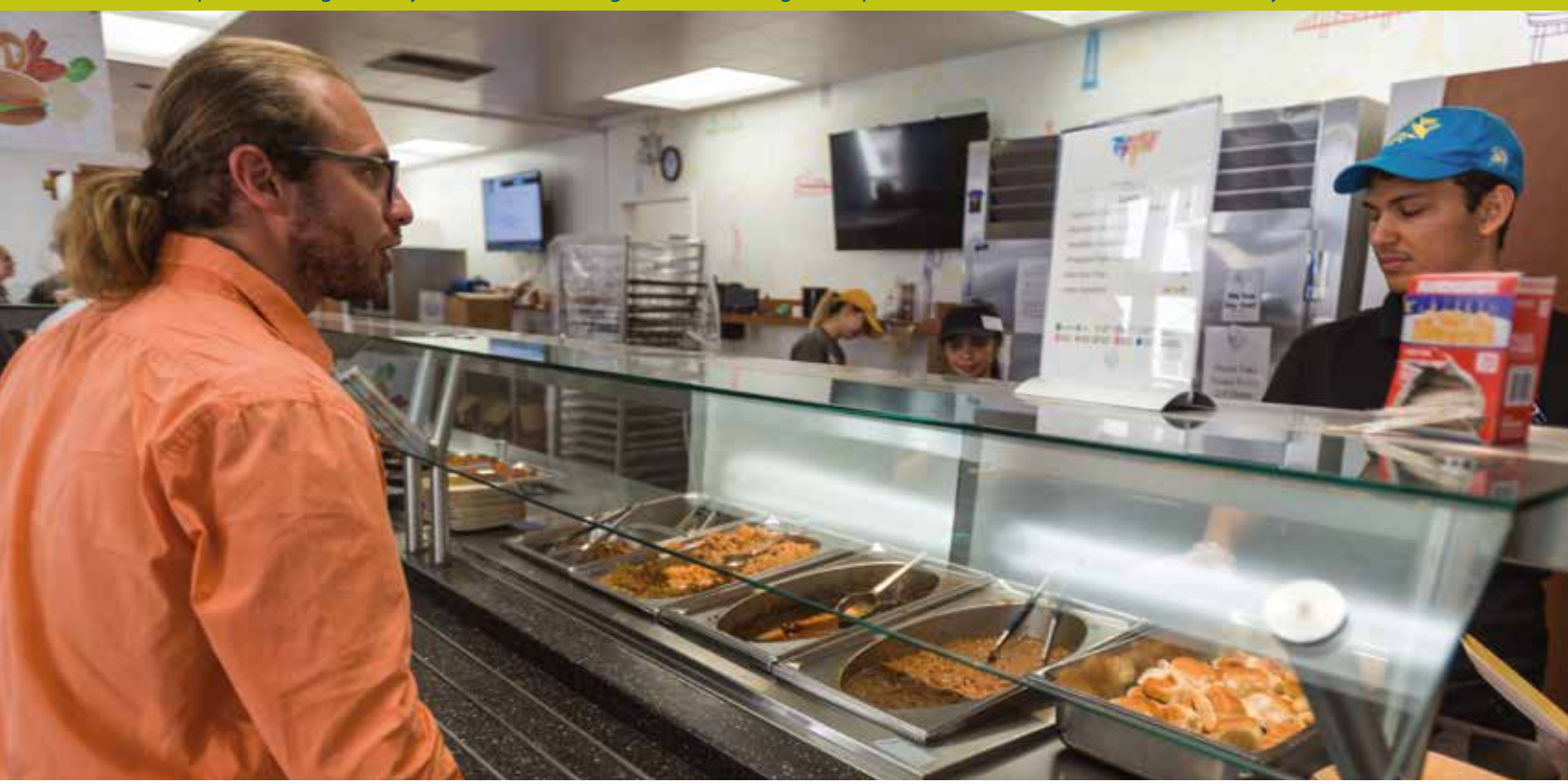
One of the perks of being a Faculty in Residence—along with free housing and a quick walk to the office—is a cafeteria nearby.

"It's, 'Hey!' and then, 'How are you doing?' and that leads to checking in and finding out their issues and understanding them better," she says. "One of the reasons I did this was that I wanted to get a sense of the student body—who they are. And seeing each other coming to and fro and saying 'Hey' is a natural way to have that relationship."