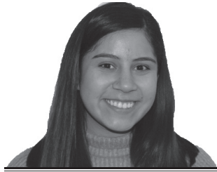
Dominoe Ibarra STAFF WRITER

But first, let me take a selfie. Then add a filter. But wait, that filter does not match my current Instagram theme and this one does. The only problem is that it is $3.99. Oh well! Anything for the 'gram.